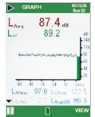
Time history display