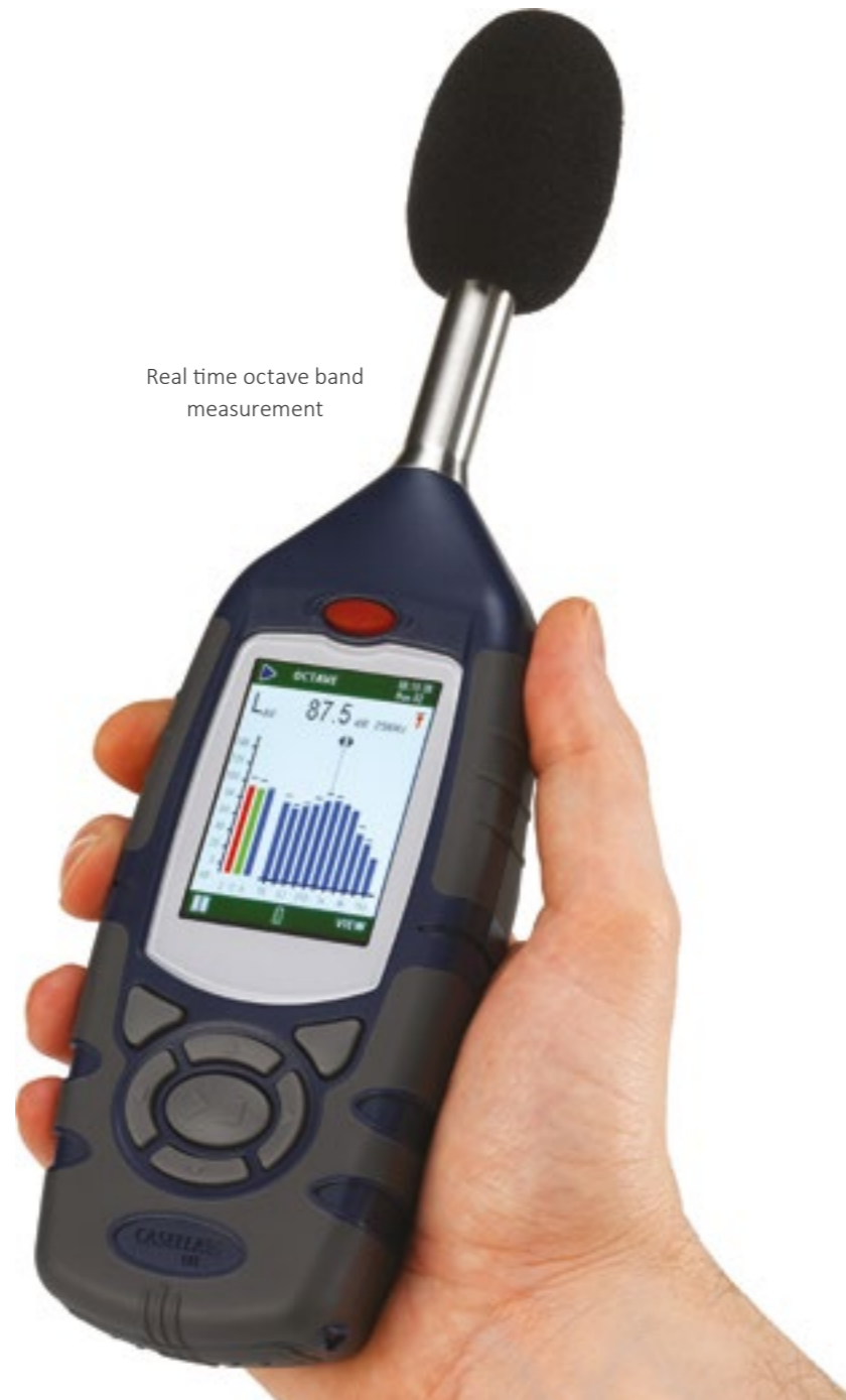
Real time octave band measurement