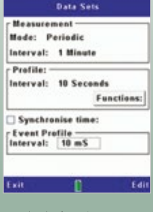
Set 2 levels of time history storage