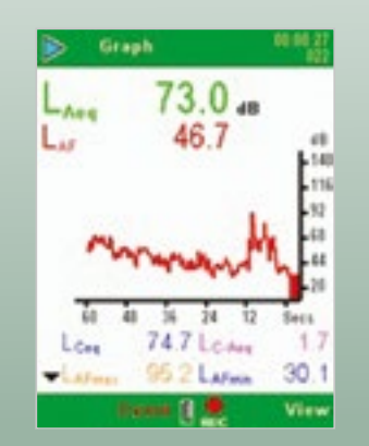
See the time history of noise levels