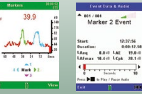
Listen to audio files from the 63X Series with headphones

An environmental noise monitoring kit is available which protects the instrument and microphone from the weather and allows unattended monitoring for up 10 days.